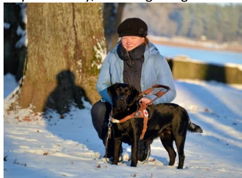
Zuze & Lolita